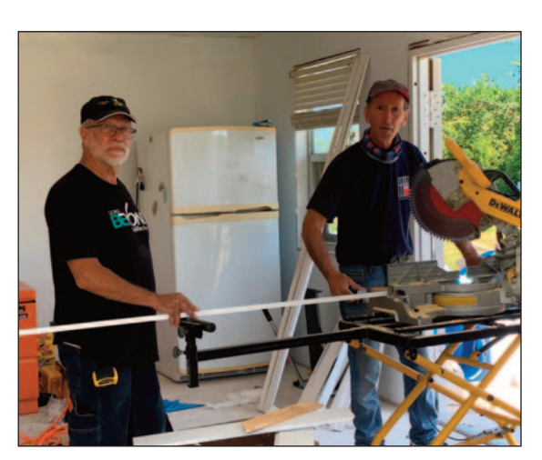
Door and window installation