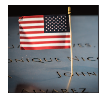
HEART 9/11 20th Anniversary Commemorative March - September 12, 2021