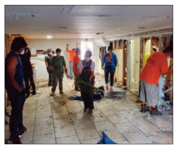
Hurricane Ida Response Queens, NY