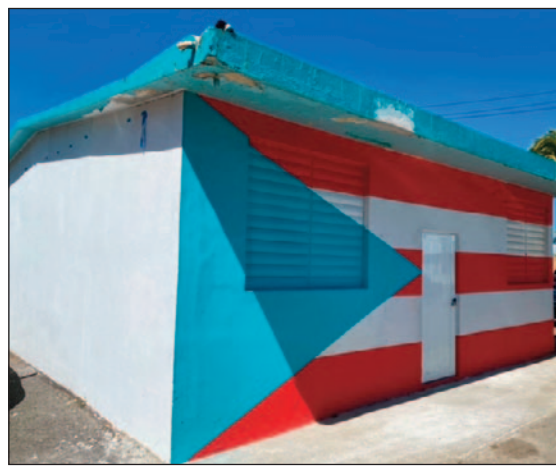
SOMOS Day of Service P.A.Y.E. School, Loiza, PR - November 4, 2021