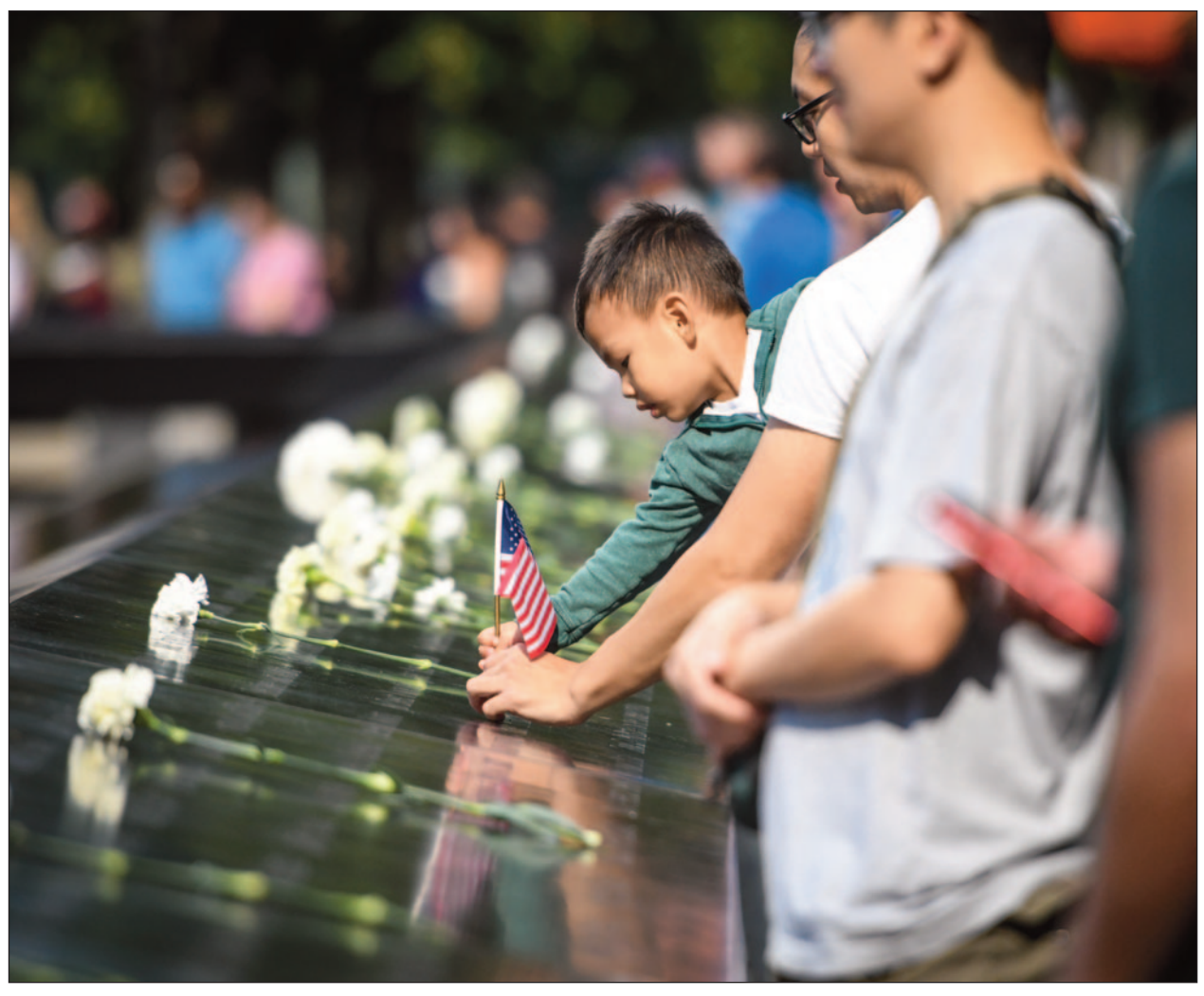
9/11 Memorial & Museum pool

Reflecting on the past 20 years, the site has changed into a beautiful memorial and museum, but the grief of the families is still self-evident. HEART 9/11 members are proud of the role they played in the recovery. We are even more motivated to propagate the selfless sacrifice of our brave colleagues to others affected by disaster and to transfer their legacy to a new generation of first responders.