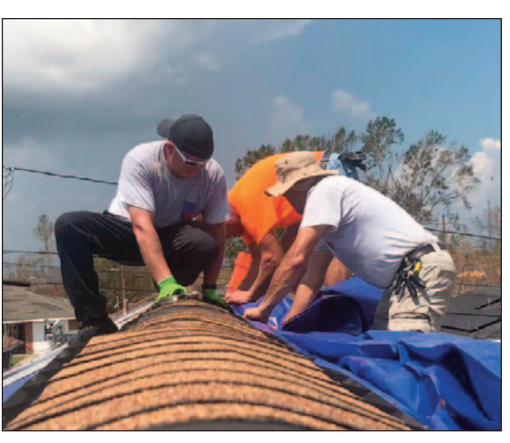
Hurricane Ida Response Louisiana