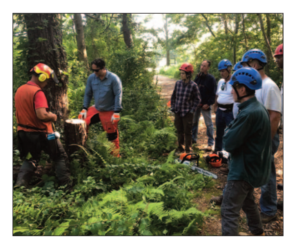
Storm Damage Chainsaw Training - Bethpage State Park, Long Island