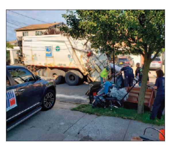
Hurricane Ida Response Staten Island, NY