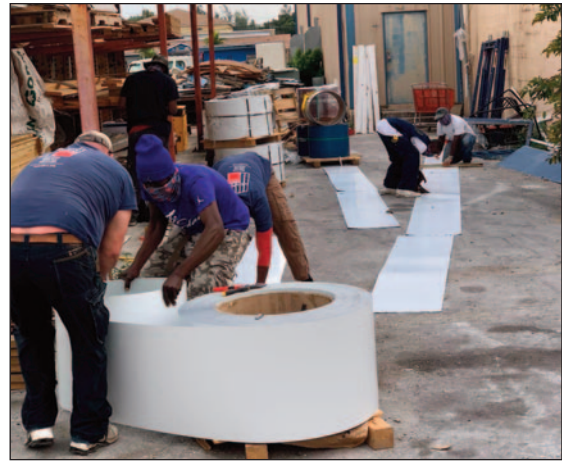
Hurricane Dorian Pre-Apprentice Class 2 picking up roofing material

HEART 9/11 completed our Pre-Apprentice Training Program in Grand Bahama. This program trained 33 local residents in the roofing and carpentry skills necessary to rebuild 54 homes in their communities.