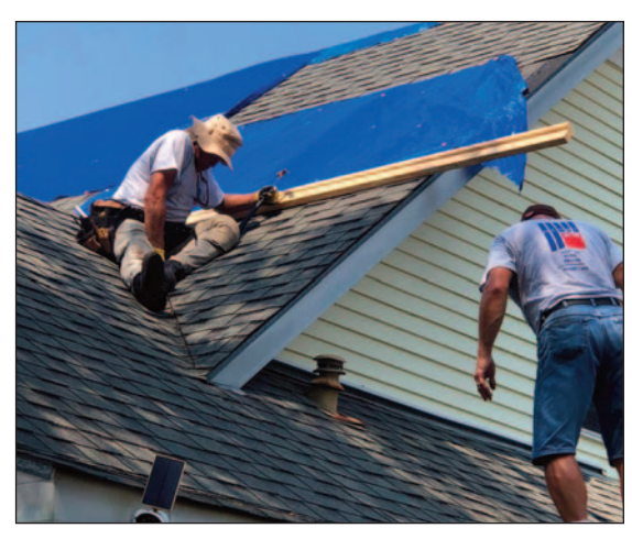
Hurricane Ida Response Louisiana

HEART 9/11 volunteers also assisted families impacted by severe flooding from Hurricane Ida in Staten Island and Queens, NY, with debris removal and muck outs/gutting.