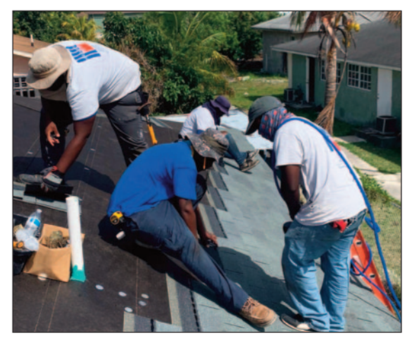
Hurricane Dorian Pre-Apprentice Class 2 roofing